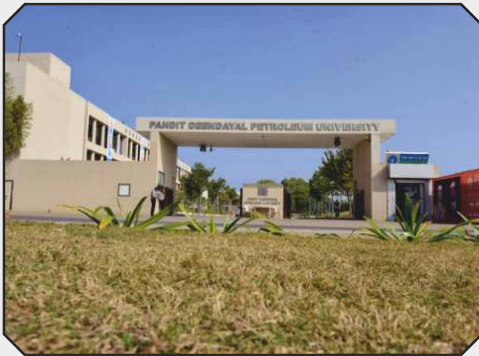
Pandit Deendayal Petroleum University